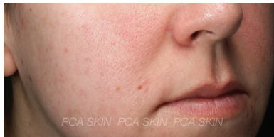
Solution: Acne Gel. *Photos not retouched.