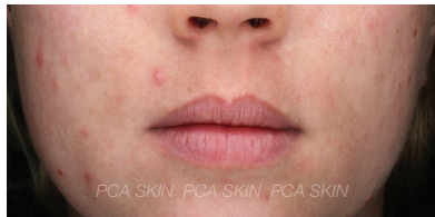
Condition: Acne breakouts.*