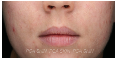
Solution: Acne Gel. *Photos not retouched.