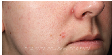
Condition: Acne breakouts.*